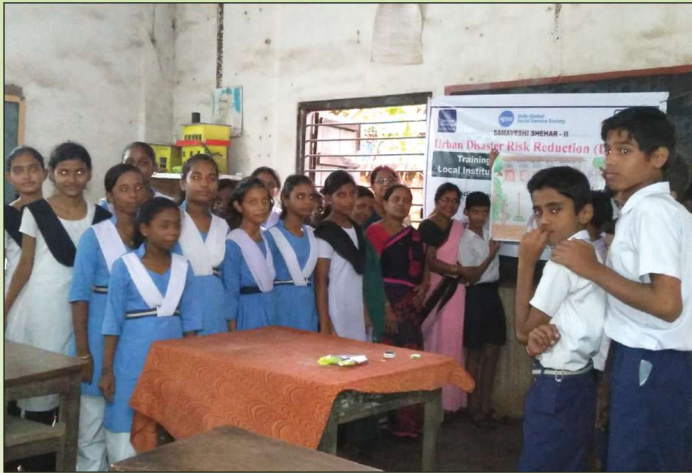
Evacuation Map of the School prepared by the Students