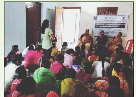
Training on Psychosocial Dynamics and Stress Management