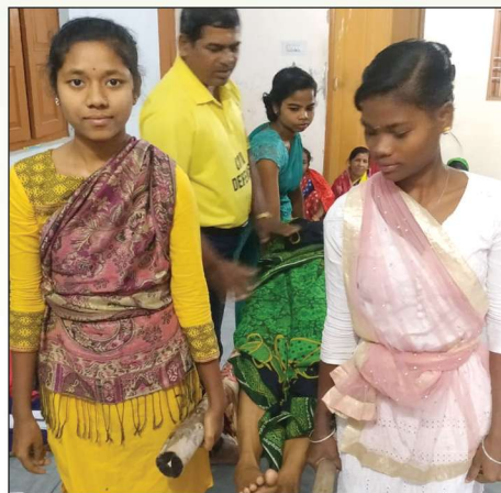
Training on Rescue & Rehabilitation