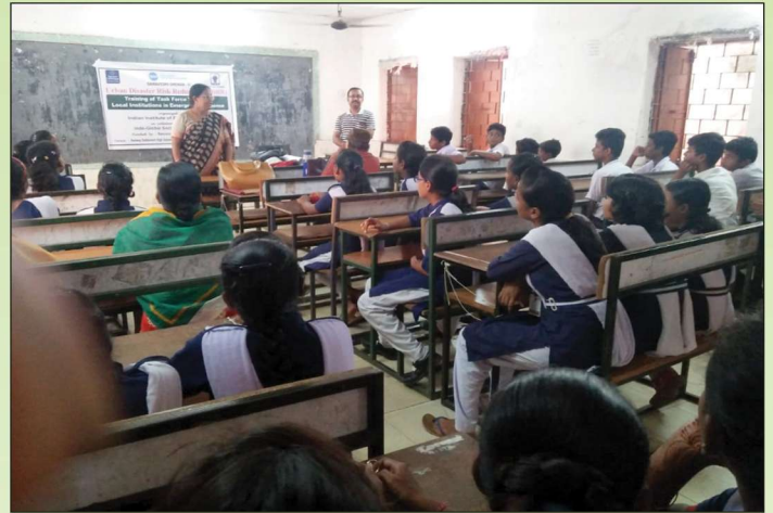
Training to Task Force in local institution

As a part of Samaveshi Shehar, an Urban Disaster Risk Reduction (UDRR) pilot initiative has been undertaken by IIEC & IGSSS in Cuttack Municipal Corporation Jurisdiction. This initiative aims to develop a mitigation plan for strengthening slum communities on preparedness against disasters such as fire, cyclone and other mishaps. Formation of task force and training to them on different aspects like First Aid, Rescue and rehabilitation, Psychosocial Dynamics and Stress Management were under taken. Besides these, Vulnerability Mapping & Evacuation map of the area including Local Institutions have been carried out.