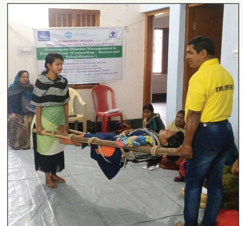
Training on Rescue & Rehabilitation