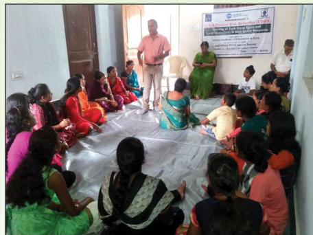
Training to Task Force in Emergency Response