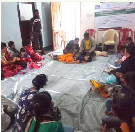
First Aid Training